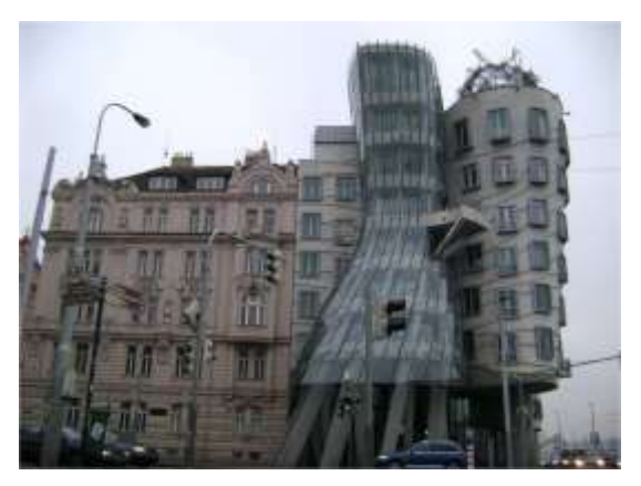
Figure 2: Dancing Building in Prague