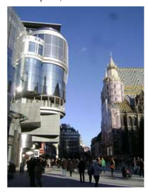
Figure 3: Haas Haus in Vienna

to its medieval milieu. Having been based on the principal that "modern house are built on top of medieval ruins," this addition occupies the second level and above, suspending above street level. To support this cylindrical protrusion, blocks of marble project out from the building and downward to the lower levels, which are adorned with stone. (www.archdaily.com).