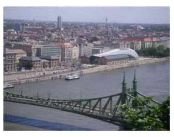
Figure 1: CET Building in Budapest (Author, 2012)

The contemporary tube of steel and glass is positioned between 19th century warehouses. (www.designboom.com). With Transformation from Old to New, Three of the 6 warehouses are now remaining, and the brief requests to keep at least 60% of the volume intact, while rightfully demanding to take away the first 20m of the 2 warehouses closest to the city to create a small square to improve the connection with the city south of the beautifully renovated Vásárcsarnok. Taking this into consideration, the design team proposes to develop the Közraktárak landmark complex in a smooth transition from old to new. (bujatt.com). (Figure 1).